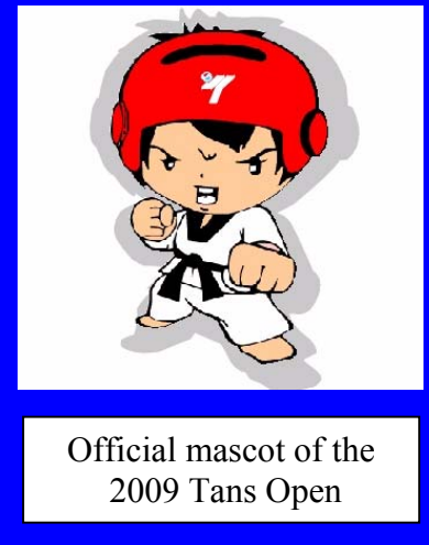
Official mascot of the 2009 Tans Open

Students and Instructors are encouraged to enter early to allow match up's for our interstate and NZ participants to confirm flights.